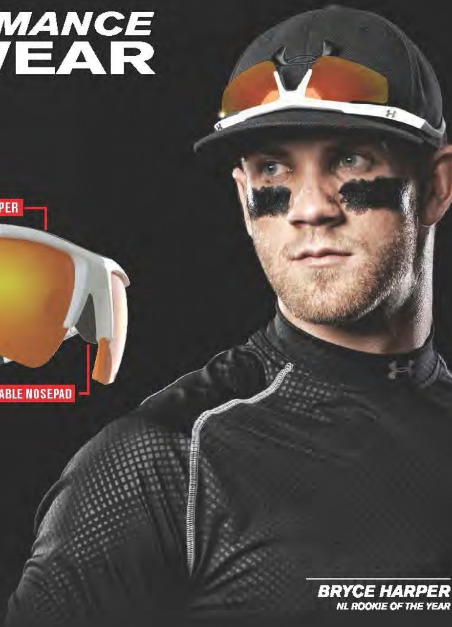
BRYCE HARPER NL ROOKIE OF THE YEAR

ARMOURFUSION™ Ultra-lightweight, impact-resistant sunglass frames.